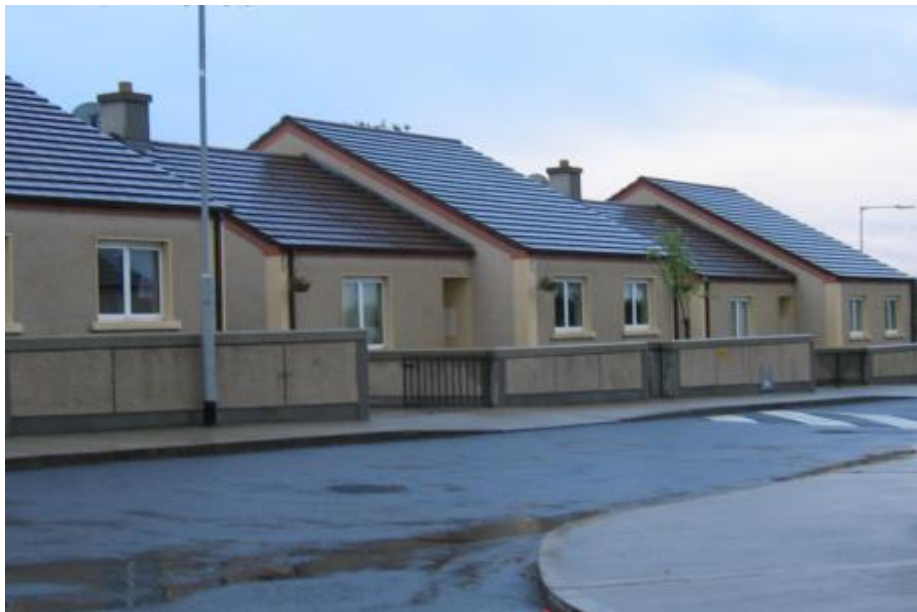
Avila Group Housing Scheme, Finglas, Dublin 11