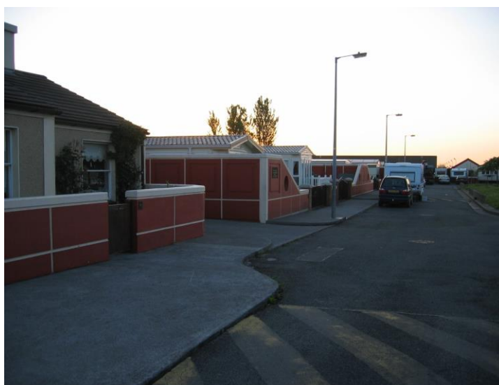
St Oliver's Park, Traveller Halting Site, Cloverhill Road, Dublin 10.