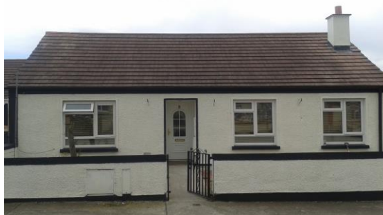
Typical House, Cara Close, Belcamp Lane, Coolock, Dublin 17