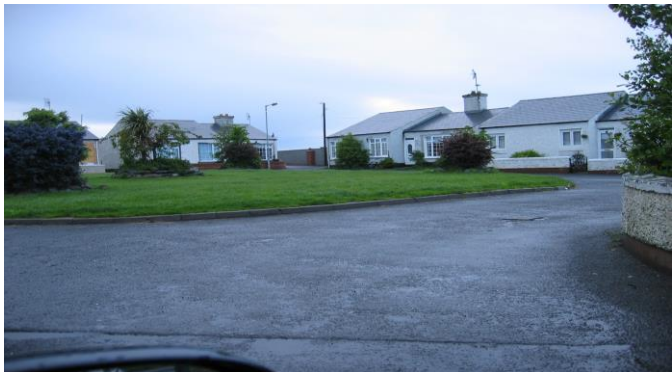
St Mary’s Park Group Housing Scheme, Dunsink Lane, Dublin 10

All projects are subject to agreement with the LTACC, Traveller Representative Groups and most importantly the members of the Traveller Community within the Local Authority Area 40 .