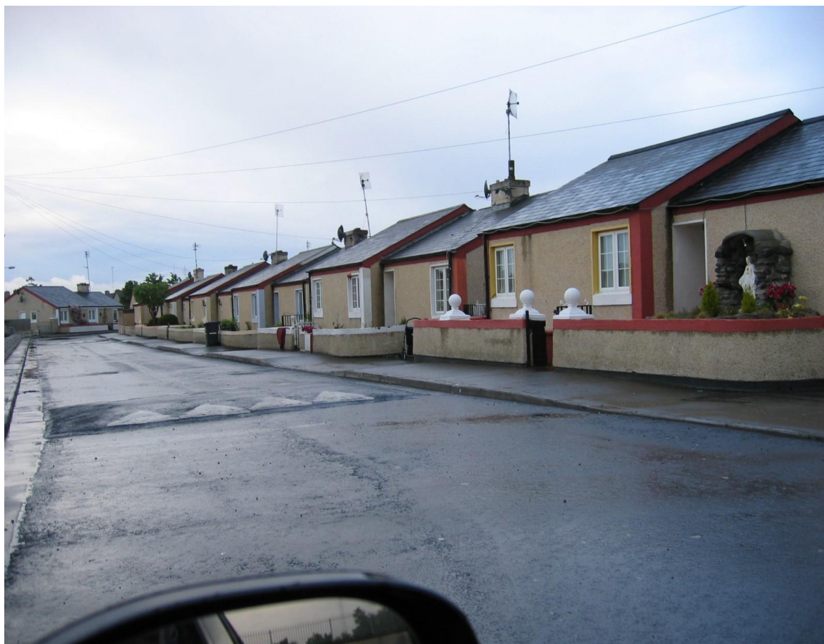
Cara Group Housing Scheme, Belcamp Lane, Coolock, Dublin 17

A review workshop of the City Council's LTACC's Terms of Reference was facilitated by the Irish Traveller Movement in 2019. This is the third such review of the workings of the LTACC following on from two previous reviews. The purpose of these reviews was to consider how the LTACC could work better and all members were able to commit to an improved and agreed set of principles in order to ensure the Committee can work more effectively. The Draft Terms of Reference agreed at the most recent workshop are detailed in Appendix 1.