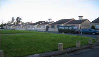
Bridgeview Group Housing Scheme

Fire safety on all sites (authorised and unauthorised) is of paramount importance. The redevelopment of Traveller Halting sites and new builds will go some way towards addressing those needs. Dublin City Council currently provides and maintains, on an annual basis, fire safety equipment on all sites including home fire/smoke alarms, carbon monoxide alarms, fire blankets and fire extinguishers in all Group Housing sites, Halting sites, sanitation units and unauthorised sites across the city. Further enhancements on Halting sites, places where grouped sanitation units are provided and unauthorised sites include the provision of larger extinguishers on external poles to assist in the prevention of fire spreading. Dublin City Council are currently seeking options with regards to external alarms on Halting sites and unauthorised sites with a view to enhancing fire safety by providing an alarm that alerts all families on site to a potential danger. Further consultation will take place where overcrowding occurs to move mobile home in order to be compliant, to allocate under the Scheme of Lettings where appropriate or to build overcrowding extensions onto existing houses 49 .